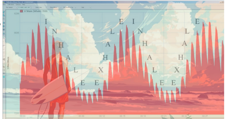
Figure 1: Catch The Wave

I have the opportunity to address many questions during a typical week. Most end up with me returning to the explanation that resonant breathing generates a wave in the circulatory system, and it is this wave that yields the benefit. Our goal is to breathe so as to generate this wave. In Coherent Breathing parlance, this wholistic wave is referred to as The Valsalva Wave .